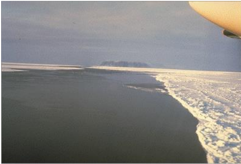
photo (200 ft): lead with new ice; thick first-year; snow; ridges

Any fracture or passageway through Sea ice* which is navigable by surface vessels.