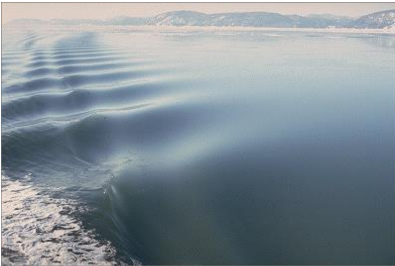
photo (50 ft): grease ice undulating under water; possibly ice foot in the background

A later stage of freezing than Frazil ice* when the crystals have coagulated to form a soupy layer on the surface. Grease ice reflects little light, giving the sea a matt appearance.