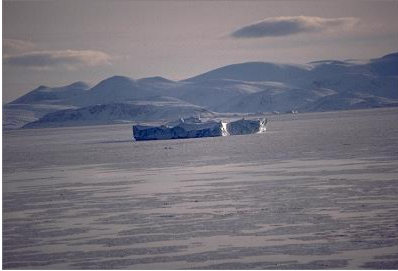
photo (50 ft): new ice; one tabular and numerous bergs in the back

A general term for recently formed ice which includes Frazil ice*, Grease ice**, Slush*** and Shuga****. These types of ice are composed of ice crystals which are only weakly frozen together (if at all) and have a definite form only while they are afloat.