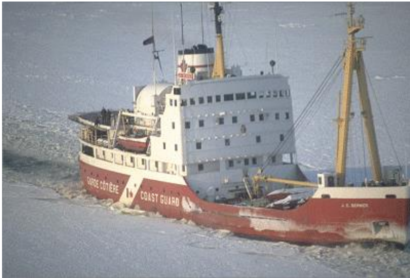
photo: grey-white fast ice; snow; small ridges (Environment Canada)