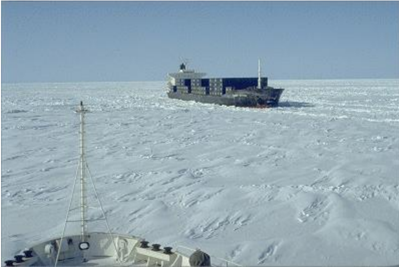
photo: thin first-year ice (measured at 60 cm); snow; ridges (Environment Canada)