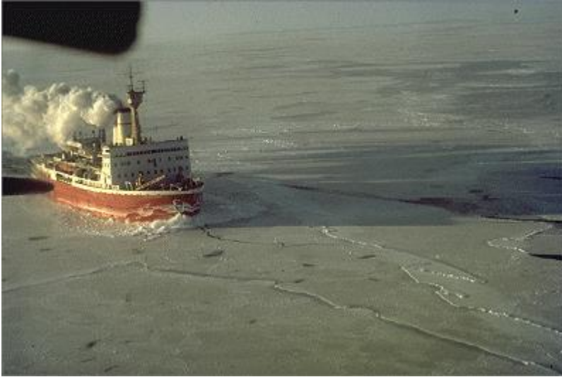
photo (150 ft): grey ice; note the convection holes also known as seal holes and typical of grey ice

Young ice* 10 - 15 cm thick. Less elastic than Nilas** and breaks on swell. Usually rafts under pressure.