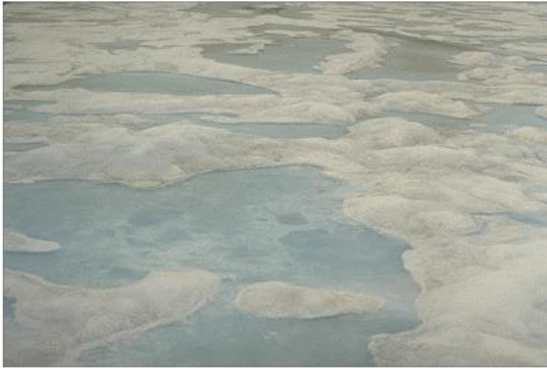
photo: multi-year ice; note puddles color; eroded surface; numerous puddles; thaw holes in the background

Old ice up to 3 m or more thick which has survived at least two summers' melt. Hummocks even smoother than Second year ice*, and the ice is almost salt-free. Color, where bare, is usually blue. Melt pattern consists of large interconnecting irregular Puddles** and a well- developed drainage system