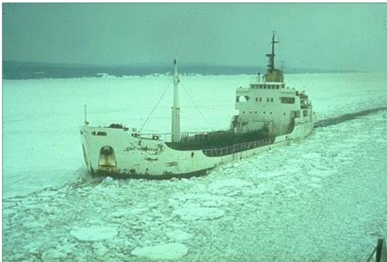
photo (50 ft): fast ice; brash in channel; ice cakes floes are detached from the fast ice; snow (Environment Canada)

Sea ice* which forms and remains fast along the coast, where it is attached to the shore, to an Ice wall, to an Ice front, between shoals or grounded icebergs. Vertical fluctuations may be observed during changes of sea-level. Fast ice** may be formed in situ from sea water or by freezing of Pack ice** of any age to the shore, and it may extend a few meters or several hundred kilometers from the coast. Fast ice may be more than one year old and may then be prefixed with the appropriate age category (old, second-year, or multi-year). If it is thicker than about 2 m above sea-level it is called an Ice shelf***.