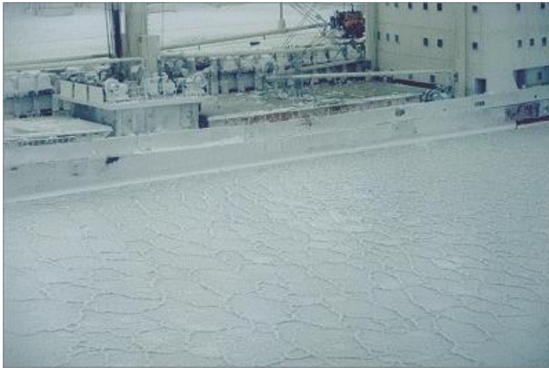
photo (20 ft): young ice; consolidated pack ice; pancake ice under pressure