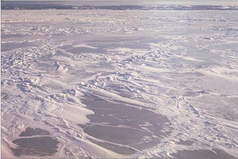
photo (50 ft): sastrugi; thin first-year ice; bare ice; ridges; snow

Sharp, irregular ridges formed on a snow surface by wind erosion and deposition. On mobile floating ice the Ridges* are parallel to the direction of the prevailing wind at the time they were formed.