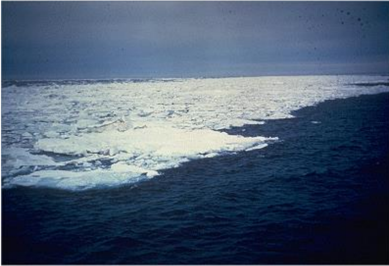
photo (20 ft): strip of medium first-year ice

Long narrow area of Pack ice*, about 1 km or less in width, usually composed of small fragments detached from the main mass of ice, and run together under the influence of wind, swell or current