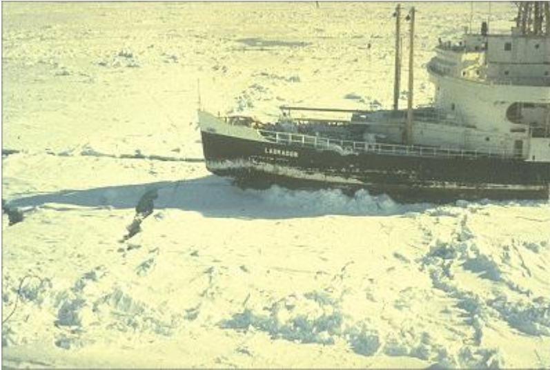
photo (50 ft) medium first-year ice; ridges; snow