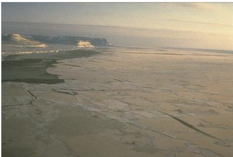
photo (200 ft): dark nilas near the shore; light nilas and grey ice in foreground; finger rafting

A thin elastic crust of ice, easily bending on waves and swell and under pressure, thrusting in a pattern of interlocking "fingers" (finger rafting). Has a matt surface and is up to 10 cm in thickness. May be subdivided into Dark nilas (Nilas which is under 5 cm in thickness and is very dark in color) and Light nilas (Nilas which is more than 5 cm in thickness and rather lighter in color than dark nilas).