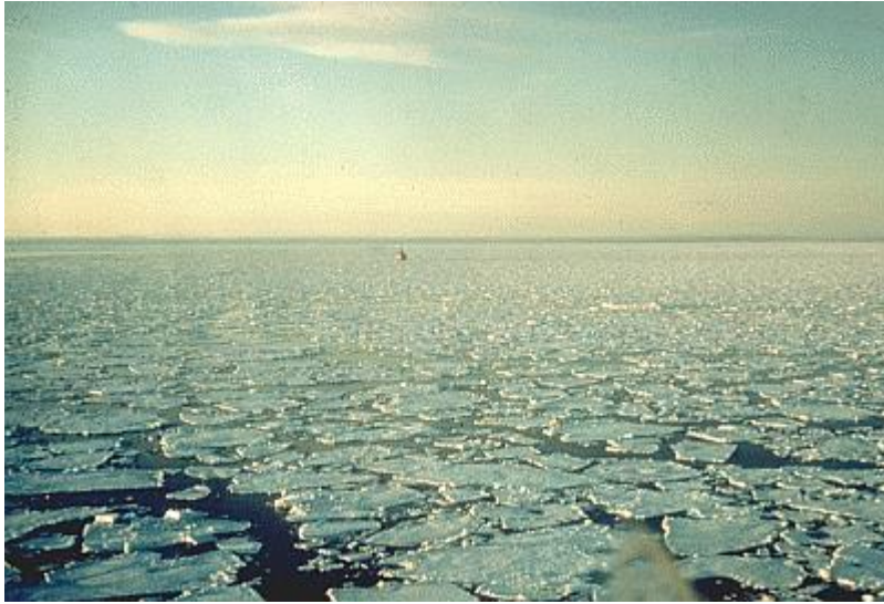
photo (60 ft): small floes; medium first-year