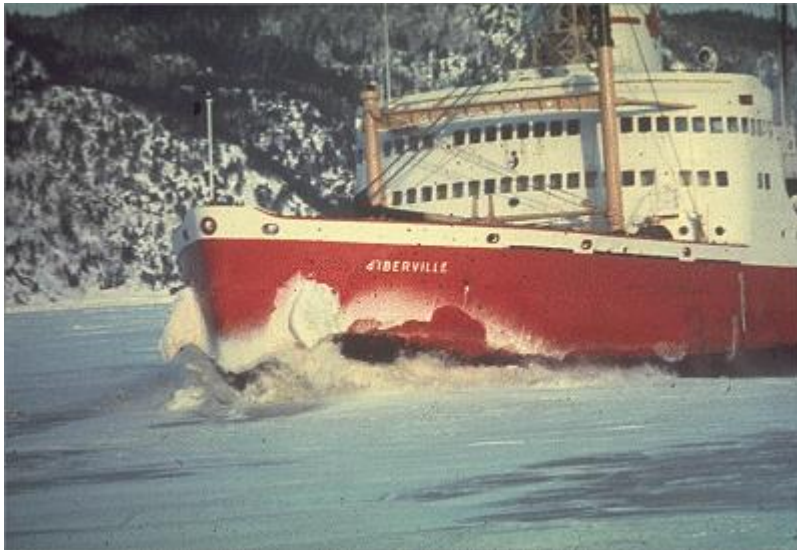
photo: thin first-year ice or grey-white fast ice; note the wave in ice ahead of the ship, this is due to the ship's mass and deep draft (32 ft)