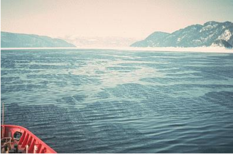
photo: grease ice and fast ice in the background