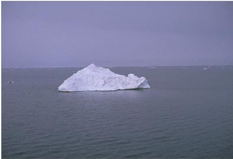
photo (30 ft): open water; 25 ft high hummock or floeberg

A large area of freely navigable water in which 'Sea ice'* is present in Concentrations less than 1/10. No 'Ice of land origin'** is present.