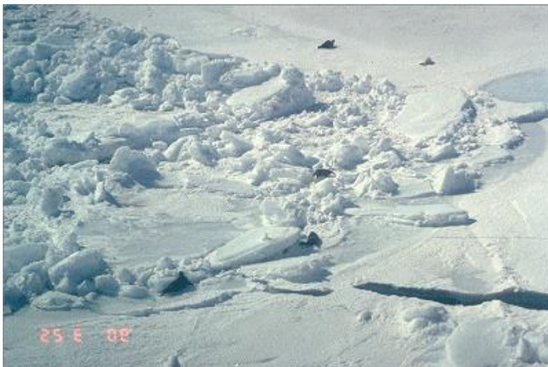
photo: medium first-year ice; frozen puddles; ridges; snow