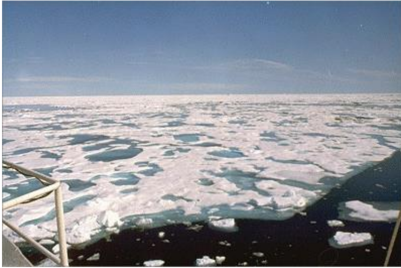
photo: typical second-year ice; eroded surface; poorly connected puddles; puddles colors; thaw holes

Old ice which has survived only one summer's melt. Because it is thicker and less dense than 'First year ice'*, it stands higher out of the water. In contrast to 'Multi year ice'**, summer melting produces a regular pattern of numerous small Puddles***. Bare patches and puddles are usually greenish-blue.