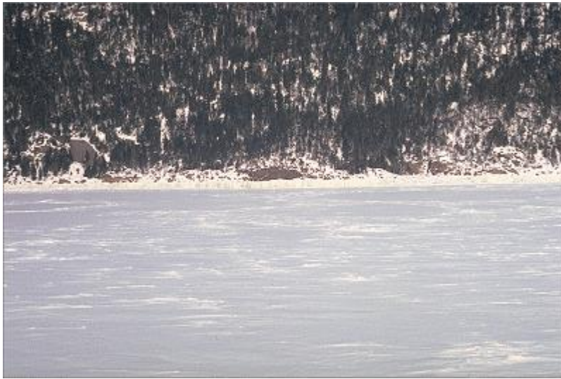
photo (50 ft): thin first-year fast ice; snow; ice foot