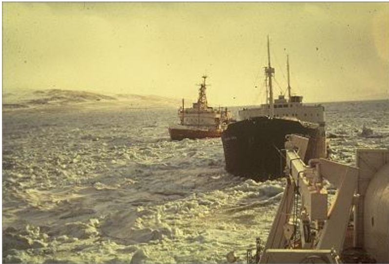
photo (50 ft): second-year ice under pressure; numerous ridges*; snow

Where the ice is subjected to pressure its surface becomes deformed. In New ice** and Young ice*** this may result in rafting as one ice floe over-rides its neighbor; in thicker ice it directs to the formation of Ridges and Hummocks**** according to the pattern of the convergent forces causing the pressure. During the process of ridging and hummocking, when pieces of ice are piled up above the general ice level, large quantities of ice are also forced downward to support the weight of the ice in the ridge or hummock. The draught of a ridge can be three to five times as great as its height and these deformations are thus major impediments to navigation. Freshly formed ridges are normally less difficult to navigate than older Weathered and consolidated ridges.