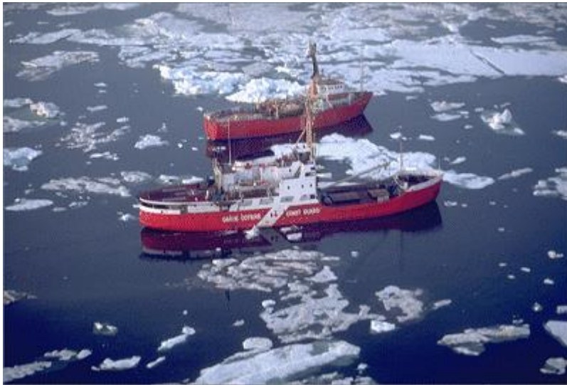
photo (300 ft): decaying thick first-year ice; puddles

During the winter, the ice usually becomes covered with snow which insulates the ice from the air above and tends to slow down its rate of growth. The thickness of snow cover varies considerably from region to region as a result of differing climatic conditions. Its depth may also vary widely within very short distances in response to variable winds and ice topography.