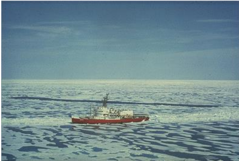
photo (150 ft): thick first-year ice; blind lead behind; puddles

Sea ice* of not more than one winter's growth, developing from Young ice**; thickness 30 cm - 2 m. May be subdivided into 'Thin First year ice'*** / white ice, 'Medium first year ice'**** and 'Thick first year ice'*****.