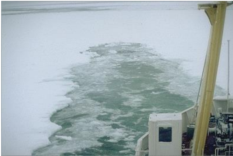
photo (30 ft): snow covered thin first-year ice

During the winter, the ice usually becomes covered with snow which insulates the ice from the air above and tends to slow down its rate of growth. The thickness of snow cover varies considerably from region to region as a result of differing climatic conditions. Its depth may also vary widely within very short distances in response to variable winds and ice topography.