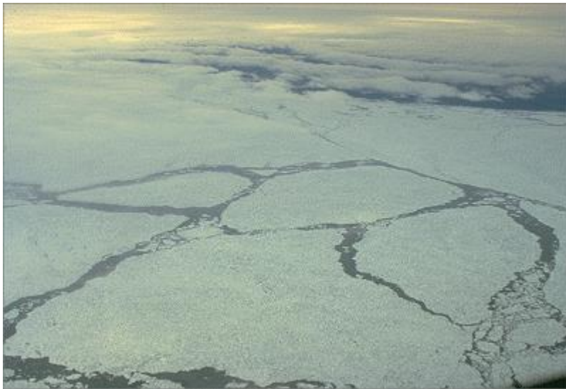
photo (5000 ft): giant floes; thick first-year

Any relatively flat piece of sea ice 20 m or more across.