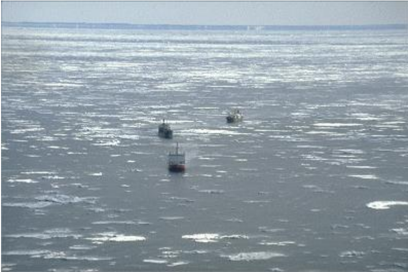
photo: very open pack ice; medium first-year; icebergs

Pack ice in which the Concentration is 1/10 to 3/10 and water preponderates over ice.