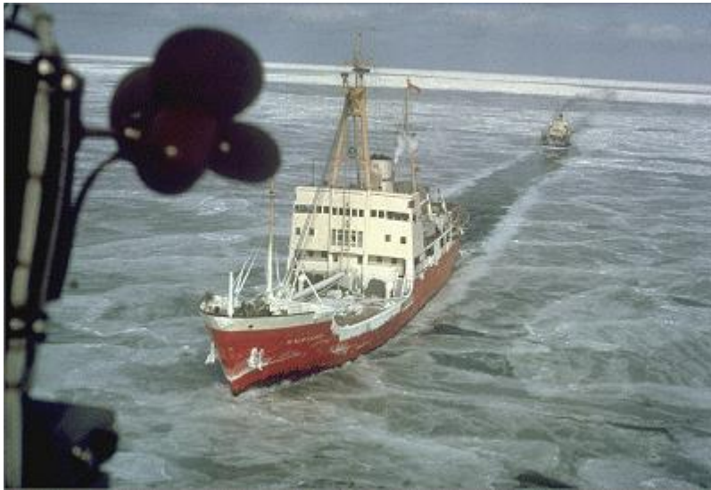
photo (80 ft): light nilas; considerable rafting; grey-white ice or first-year ice in the background (Environment Canada)