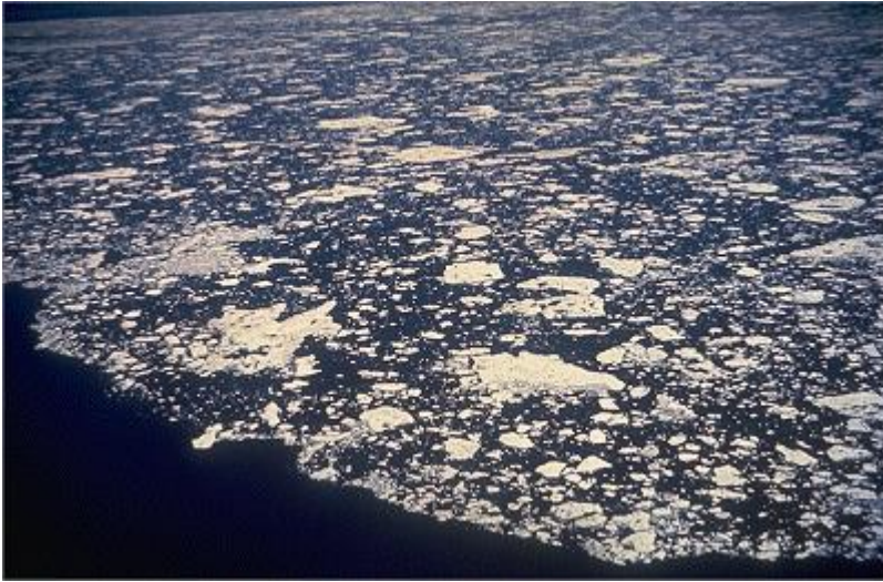
photo (2000 ft): ice edge; medium first-year ice in small floes; brash

The boundary at any given time between open water and sea, river or lake ice of any kind, whether drifting or fast; may be termed compacted when it is clear-cut, or open when it forms the indefinite edge of an area of dispersed ice.