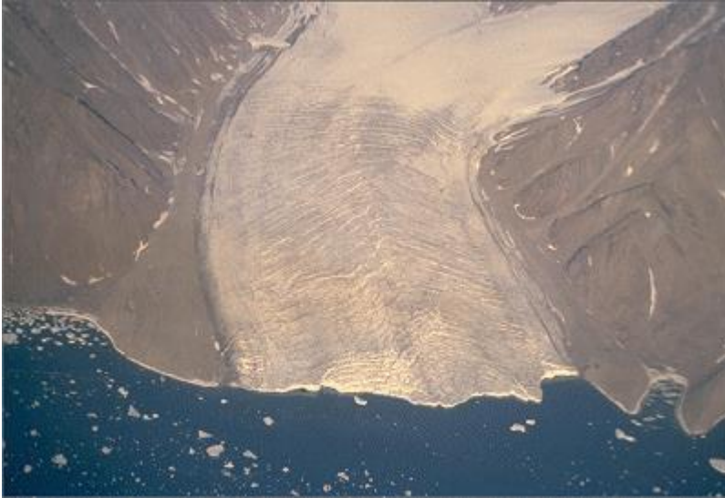
photo: glacier; ice stream; calving; ice front; ice bergs (Environment Canada)

A mass of snow and ice continuously moving from higher to lower ground or, if afloat, continuously spreading. The principal forms of glacier are inland ice sheets, ice shelves, Ice streams*, ice caps, ice piedmonts, cirque glaciers and various types of mountain (valley) glaciers.